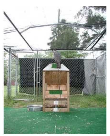
Roy Dewitt's jump box

Using this jump box inside an enclosed 6 ft high covered fenced area you will meet all the federal and state standards for keeping your hawk. You can use netting or shade cloth for the cover. It will have to be elevated over the fence to keep the bird's wings from touching. The fenced area should be at about 15 ft square or big enough to keep the wings from touching the sides.